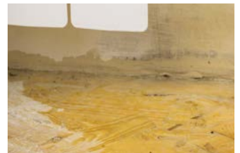
Wet area on floor and side of wall.