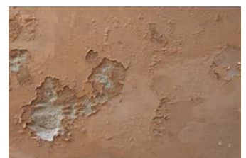
Damage to wall caused by flooding.