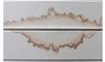
Water stained ceiling panels.